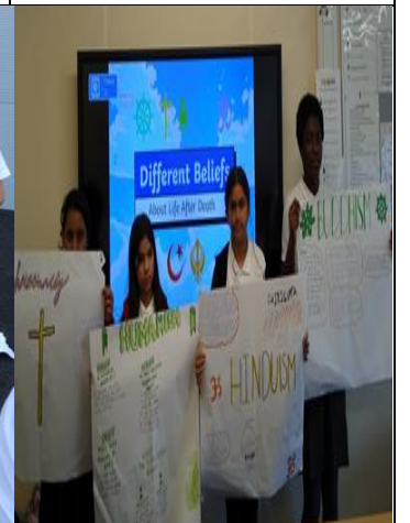
RE – Y6