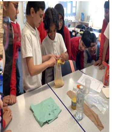
Science – Y4