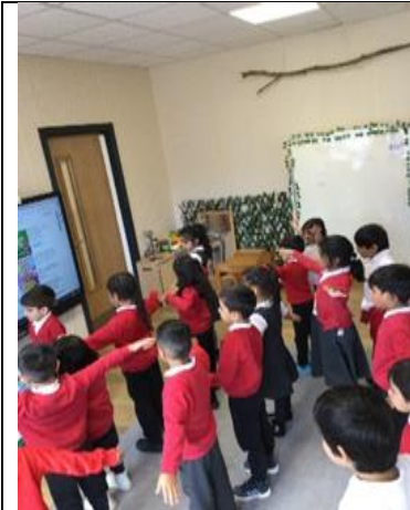
Movement - YR