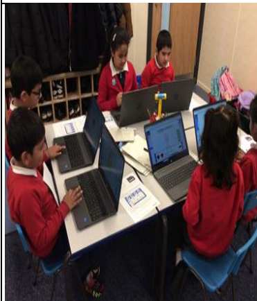
Computing – Y2