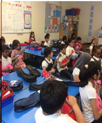
Ukulele – Y3