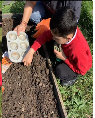
Wellies/Worms – Y1