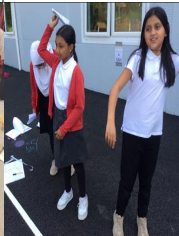
Science – Y5