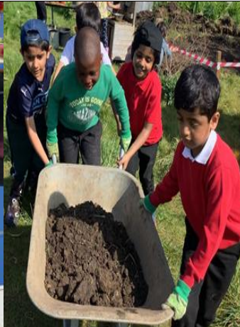
Wellies/Worms – Y1