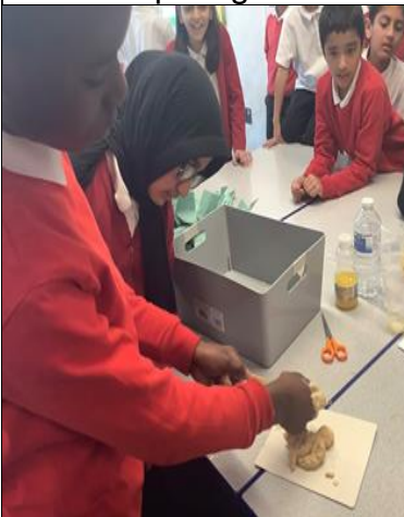
Science – Y4