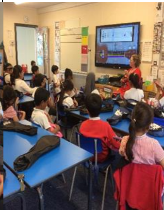
Ukulele – Y3