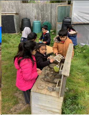
Outdoors – Y1