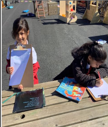
Outdoor writing – F2