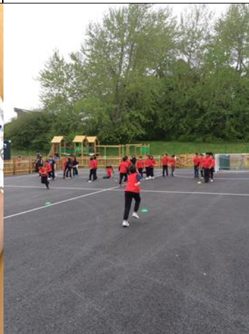
Outdoor PE – Y5