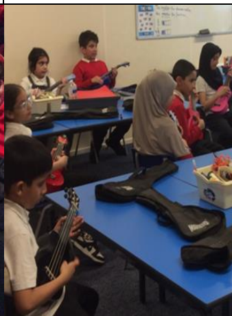
Ukulele – Y3