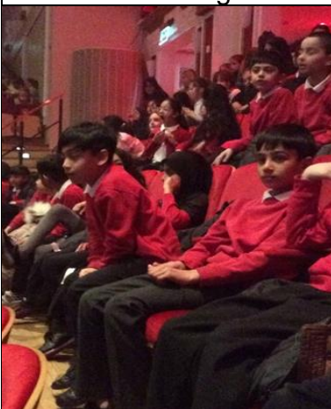
DMH Concert – Y3