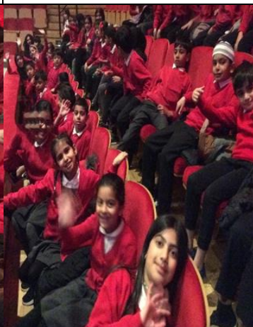
DMH Concert – Y3