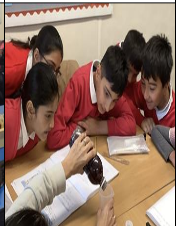
Science – Y4