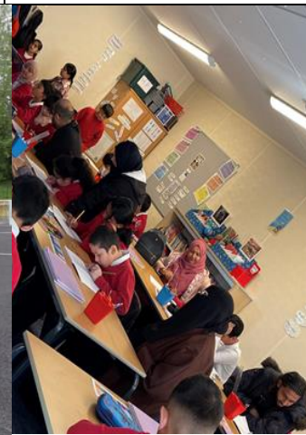
Parents Group – Y5