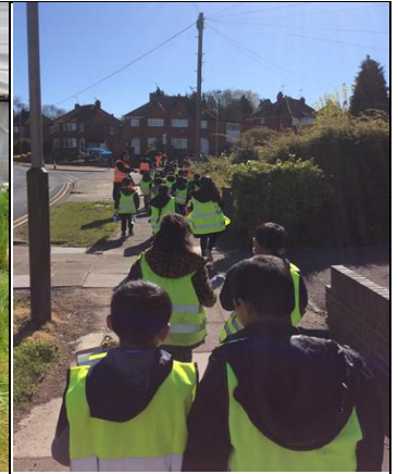
Local Walk – Y2