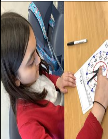
Tricky maths – Y4