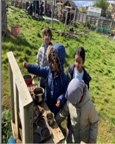
Wellies, Worms – Y1