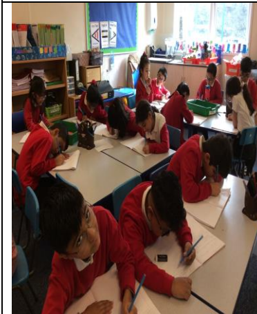
Very busy – Y2