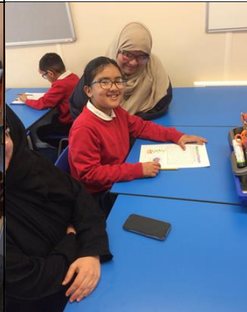
Parent Group – Y3