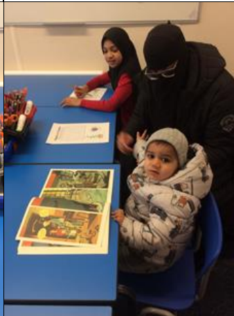
Parent Group – Y3