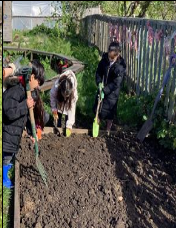
Wellies, Worms – Y1