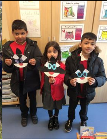
Orcas – Y2