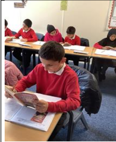
Shared Reading – Y4