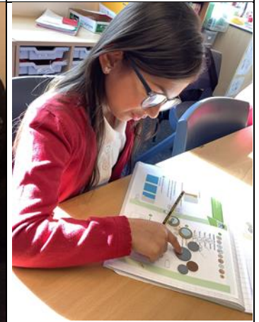
Tricky Maths – Y4