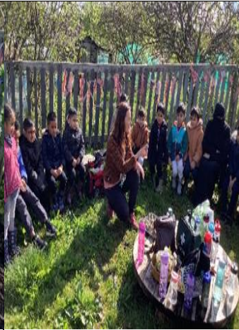
Wellies, Worms – Y1