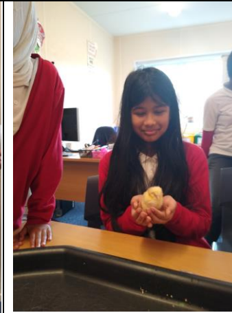
Living Eggs – Y6