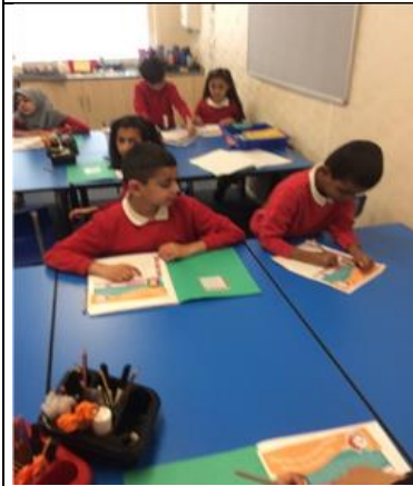
Co-operation – Y3