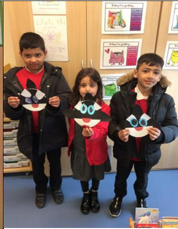
Sea Creatures – Y2