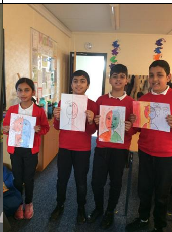
Art – Y6