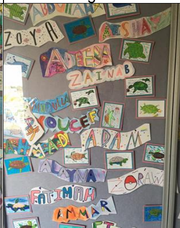
Sea Creatures – Y5