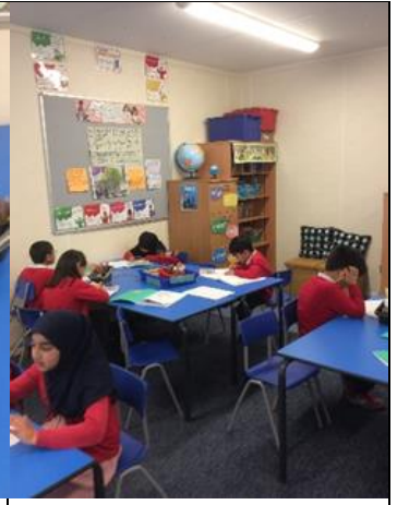
Co-operation – Y3