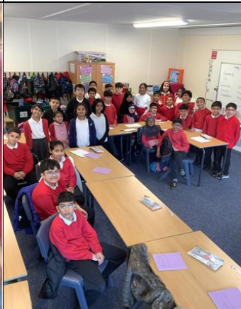
A New Room – Y4