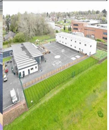
Our New School!!