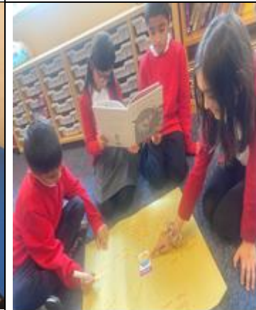
Feelings – Y4