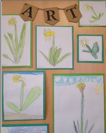
Daffodil Art – Y1