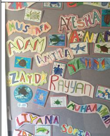
Sea Creatures – Y5