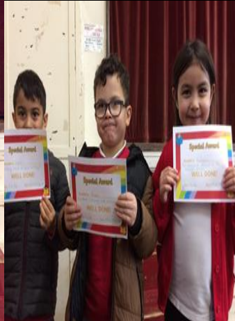
Achievements – Y2