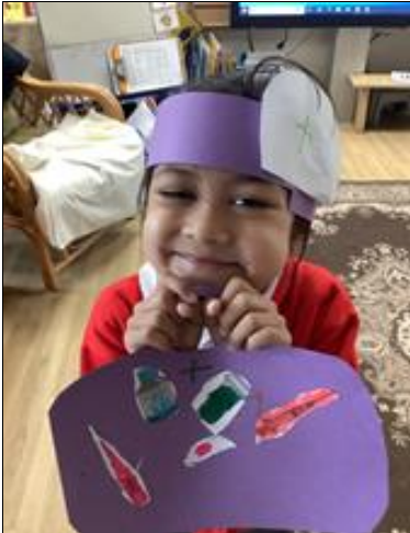
People who help - YR