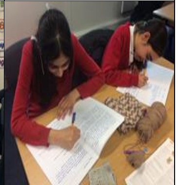
Writing – Y6