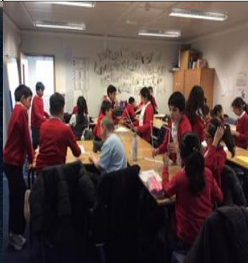
DT – Y5