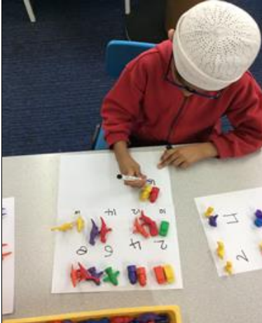
Counting in twos – Y1