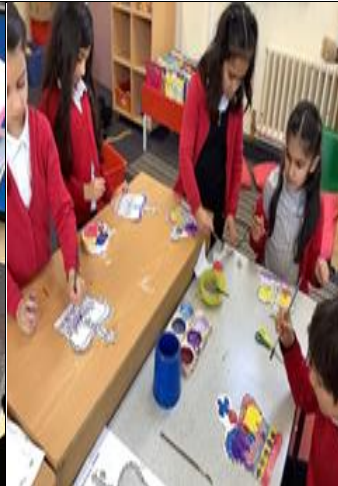
Queen Victoria – Y1