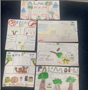
Geography – Y4