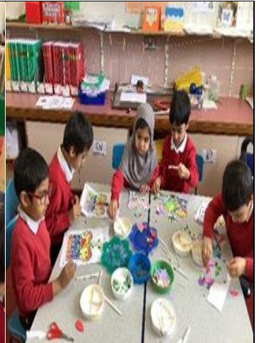
Queen Victoria – Y1