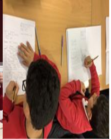
Letter to the PM – Y4