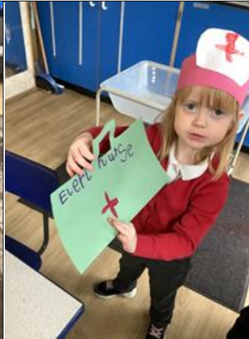
People who help - YR