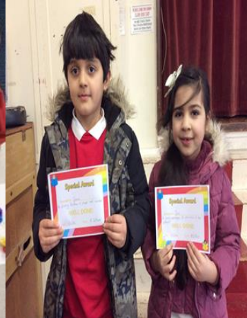
Achievements – Y2