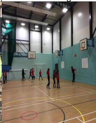
Basketball – Y5