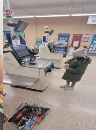
Home Learning – Y3