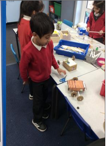
Wheels & Axles – Y2