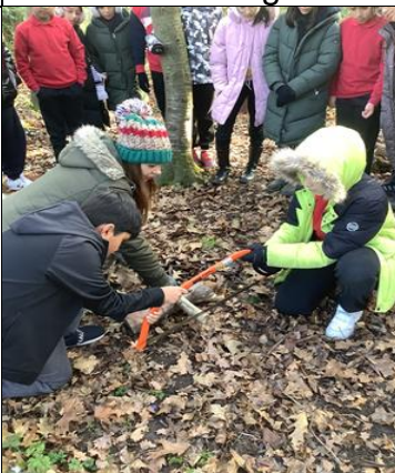
Sawing – Y5