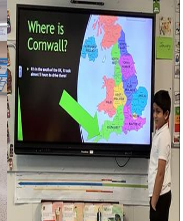
Presentations – Y4