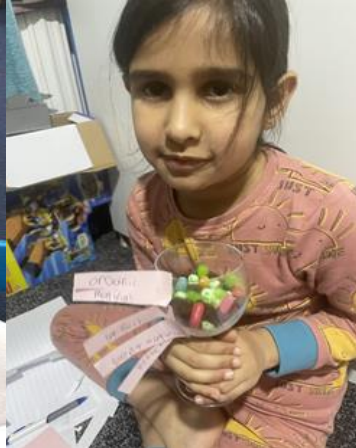
Home Learning – Y3