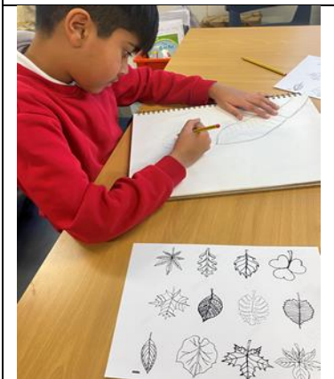
Sketching – Y4