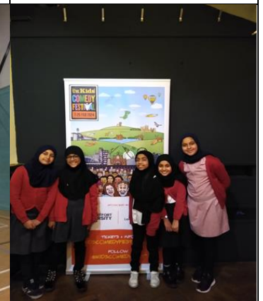
Loving Laughing – Y6