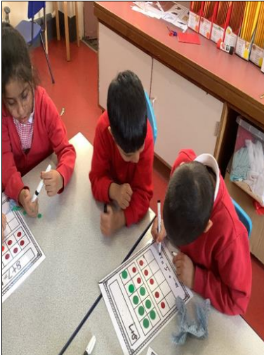
Making 10 – Y1