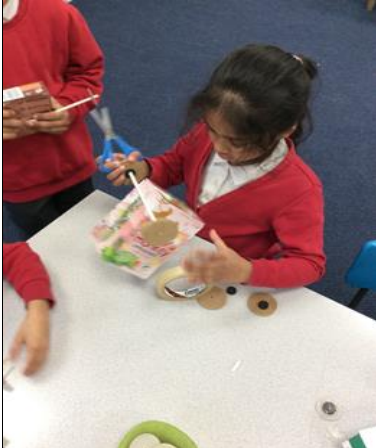
Wheels & Axles – Y2