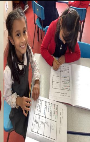
Reading – Y1