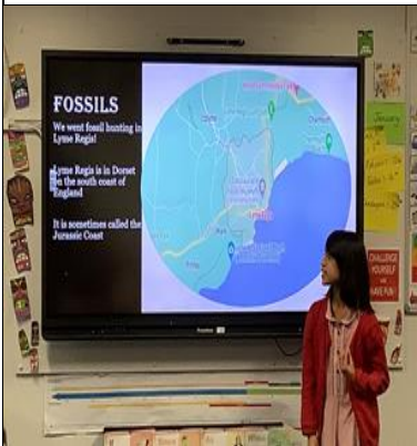
Presentations – Y4