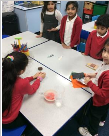
Science – Y2