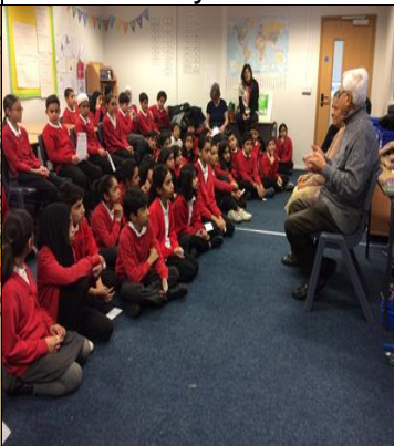
Migration – Y6