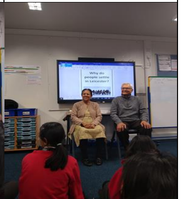
Migration – Y6