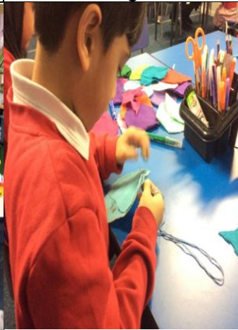
Sewing – Y3