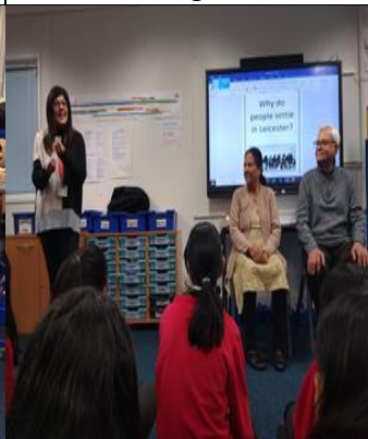
Migration – Y6