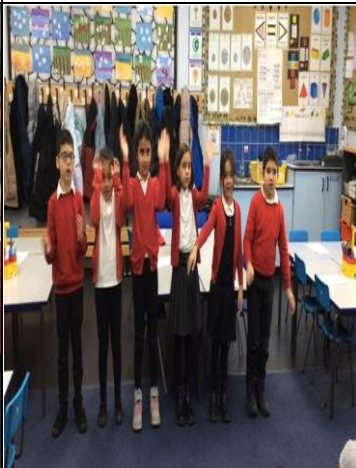
Poetry – Y2