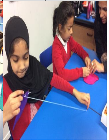
Sewing – Y3