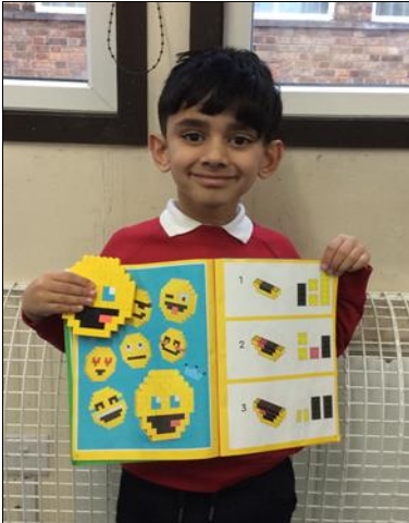
Instructions – Y1