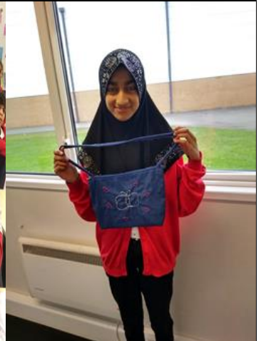
Sewing – Y6