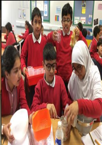
Science – Y5