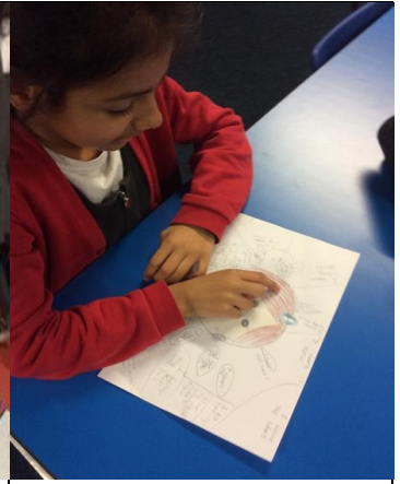
Linking Network – Y3