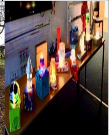
Nightlights – Y4