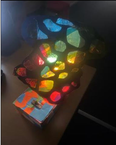
Nightlights – Y4