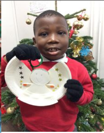
An angel – Y1