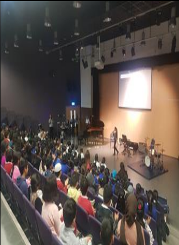
Performance – Y5