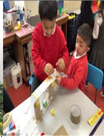
Bridges – Y1