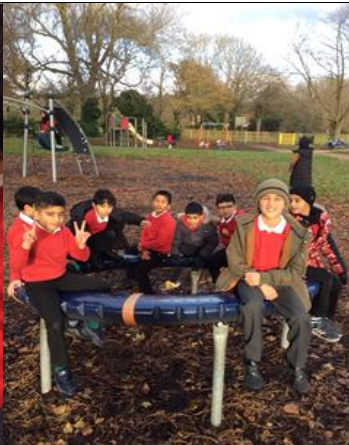
Evington Park – Y3