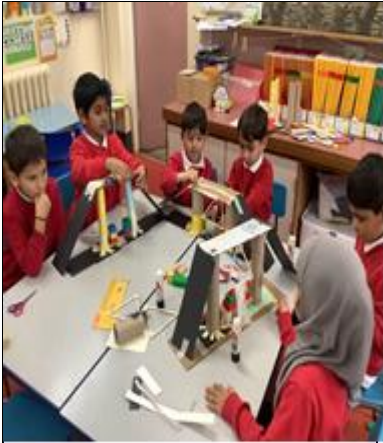
Bridges – Y1