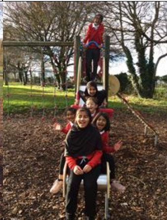
Evington Park – Y3